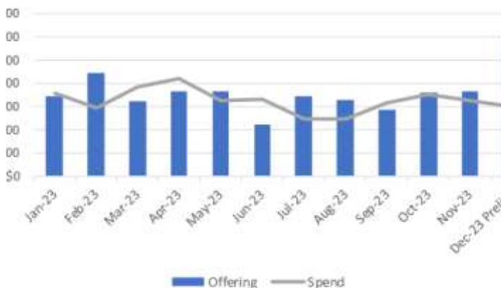
Bethel Lutheran - 2023