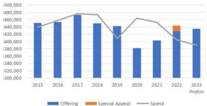
Bethel Lutheran - History

2019 Spend only had 1/3 of a year with Senior Pastor expenses