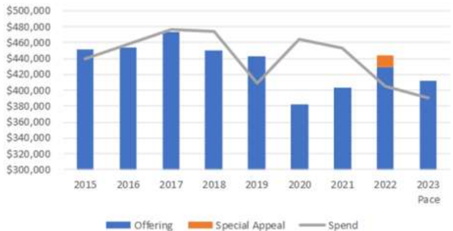
2019 Spend only had 1/3 of a year with Senior Pastor expenses