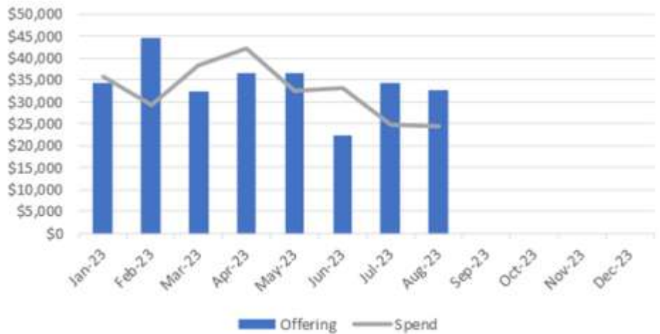
No Senior Pastor expenses in July