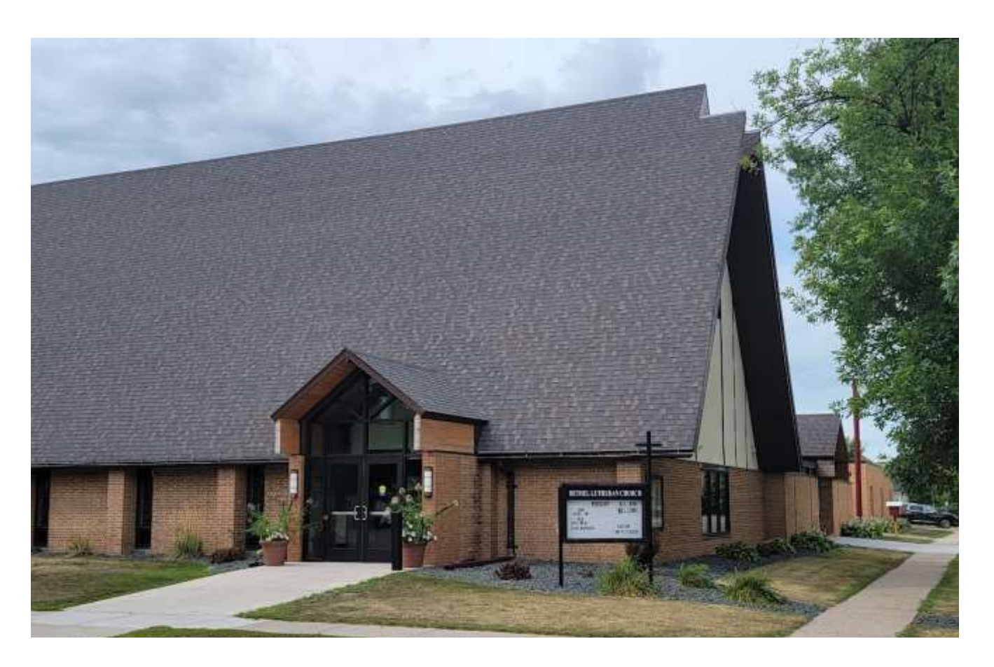
Bethel Lutheran Church Staff